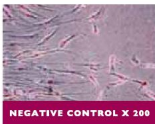
NEGATIVE CONTROL X 200