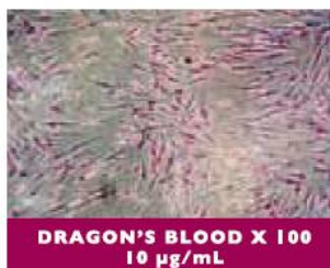
DRAGON'S BLOOD X 100 10 µg/mL